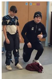
Careers week 2023