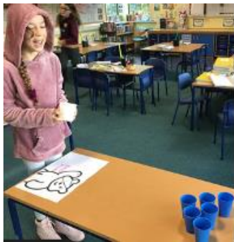
Science week 2023